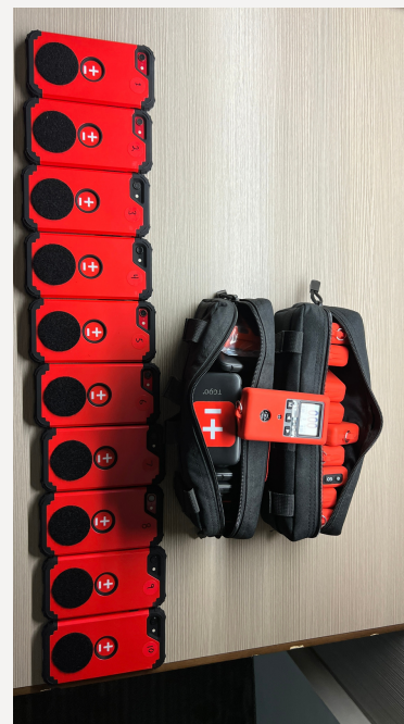
Typical JMAP Kit